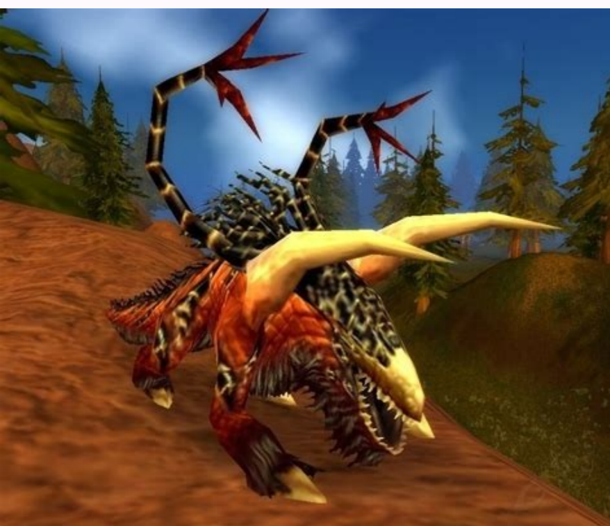
Wow classic horde warlock leveling guide.